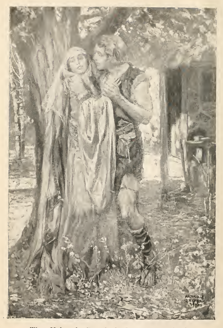
Thus Helen the Proud, the Beautiful, yielded her lips to his FRONTISPIECE. See Page 31